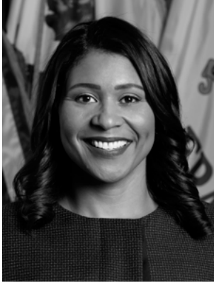
Mayor London N. Breed, City and County of San Francisco

Mayor London N. Breed is the 45th Mayor of the City and County of San Francisco and the first African-American woman Mayor in the City's history. Prior to being