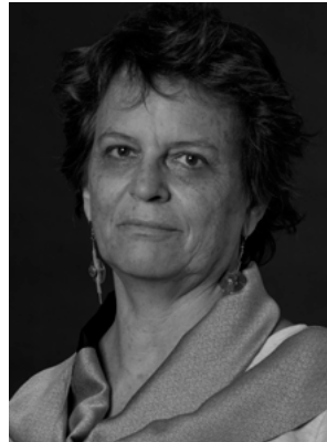
Catarina Vaz Pinto, Deputy Mayor for Culture, Municipality of Lisbon

Deputy Mayor for Culture of Lisbon City Council since November 2009, Vaz Pinto graduated in Law from the Universidade Católica