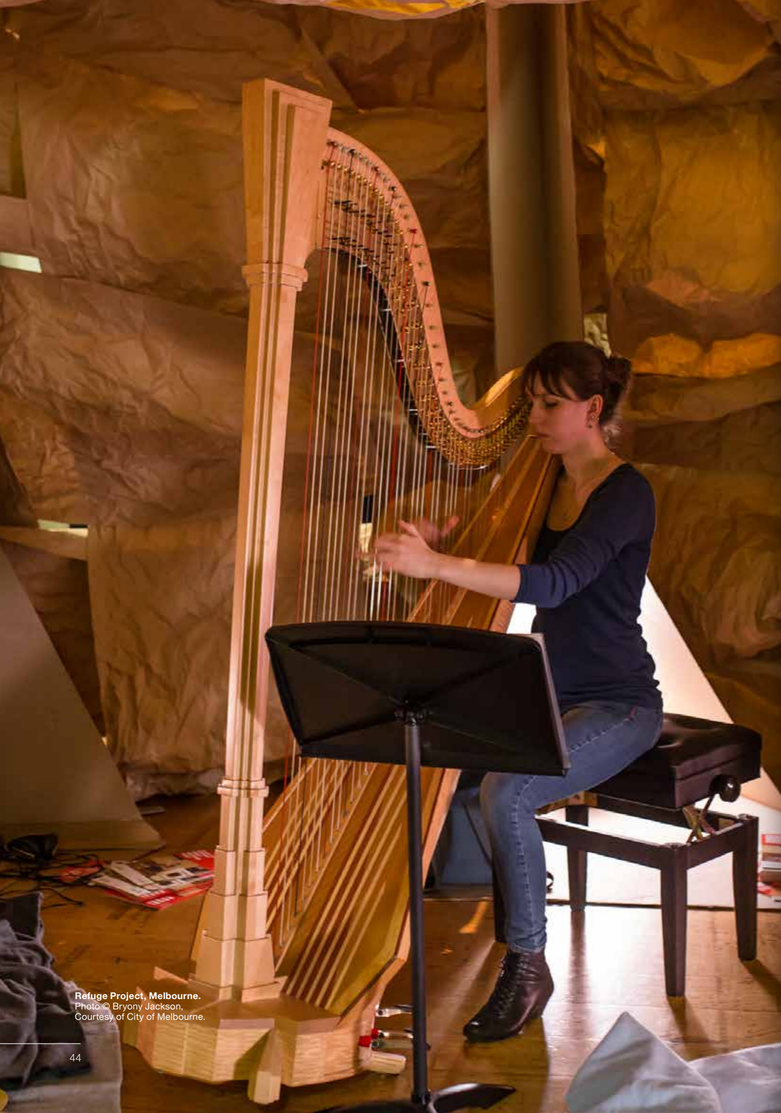
Refuge Project, Melbourne.