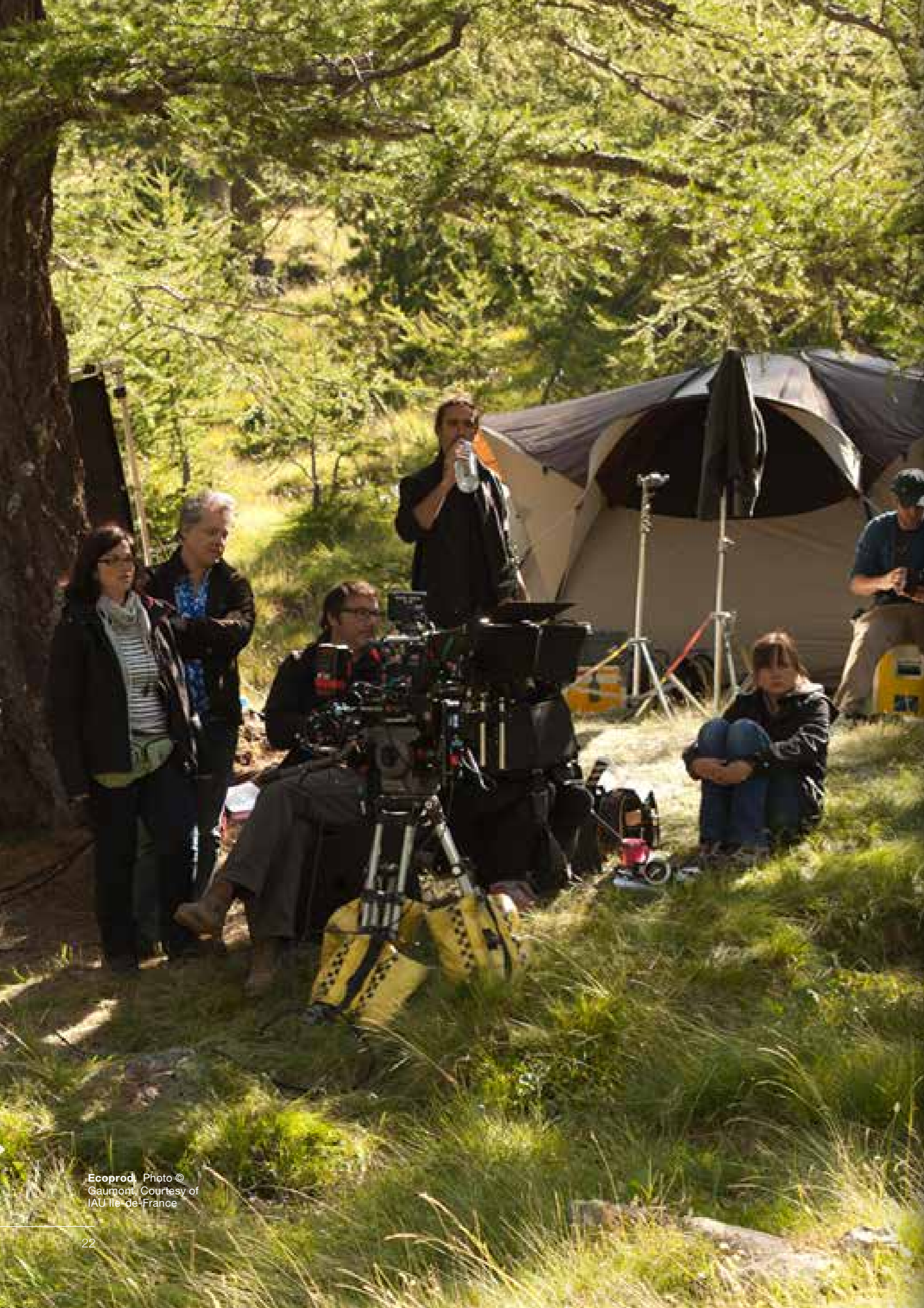
Ecoprod. Photo © Gaumont. Courtesy of IAU Île-de-France