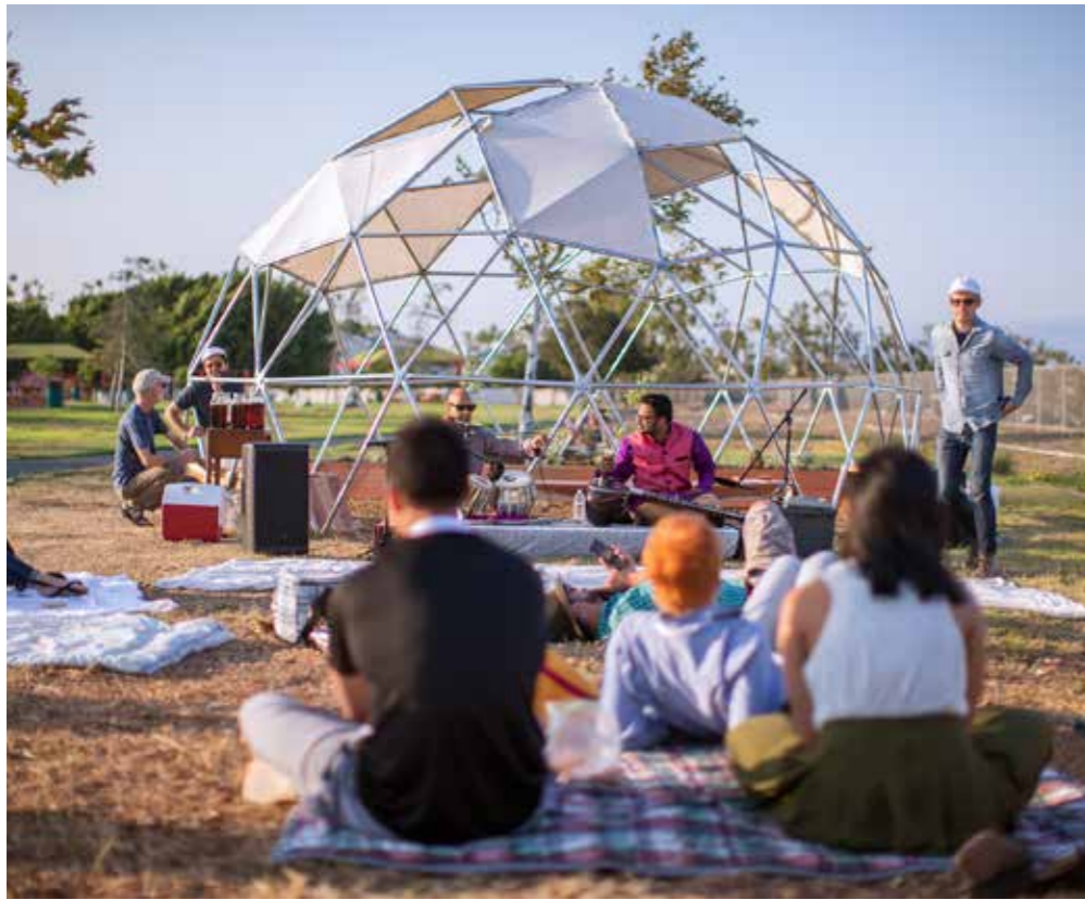
Artwork commissioned by DCA for CURRENT:LA Water [Chris Kallmyer, New Weather Station © 2016]