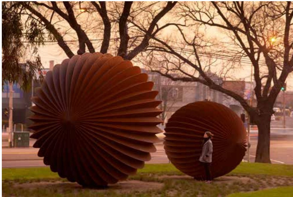
4/ New Urban Agenda. Habitat III. https://habitat3.org/the-new-urban-agenda