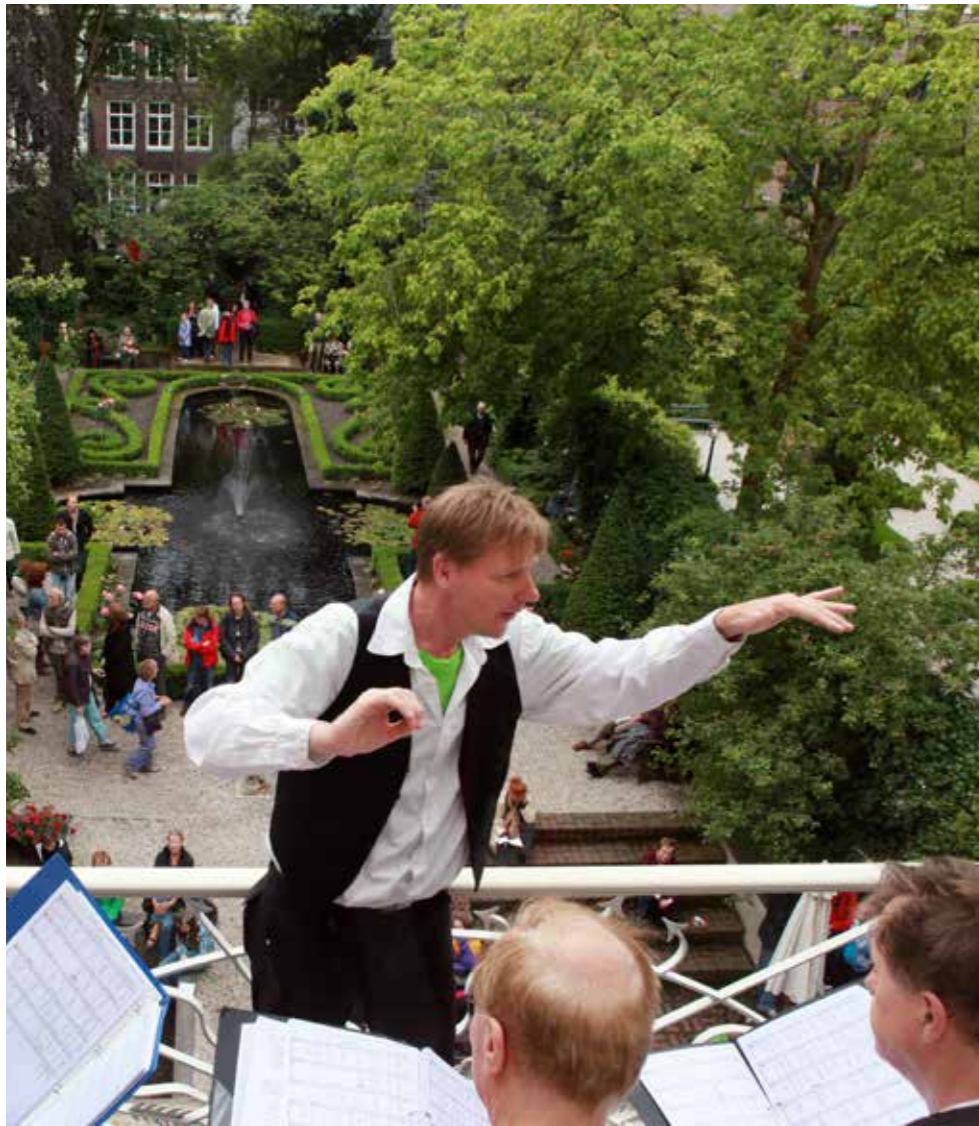
Concert at Museum Geelvinck-Hinlopen Huis.