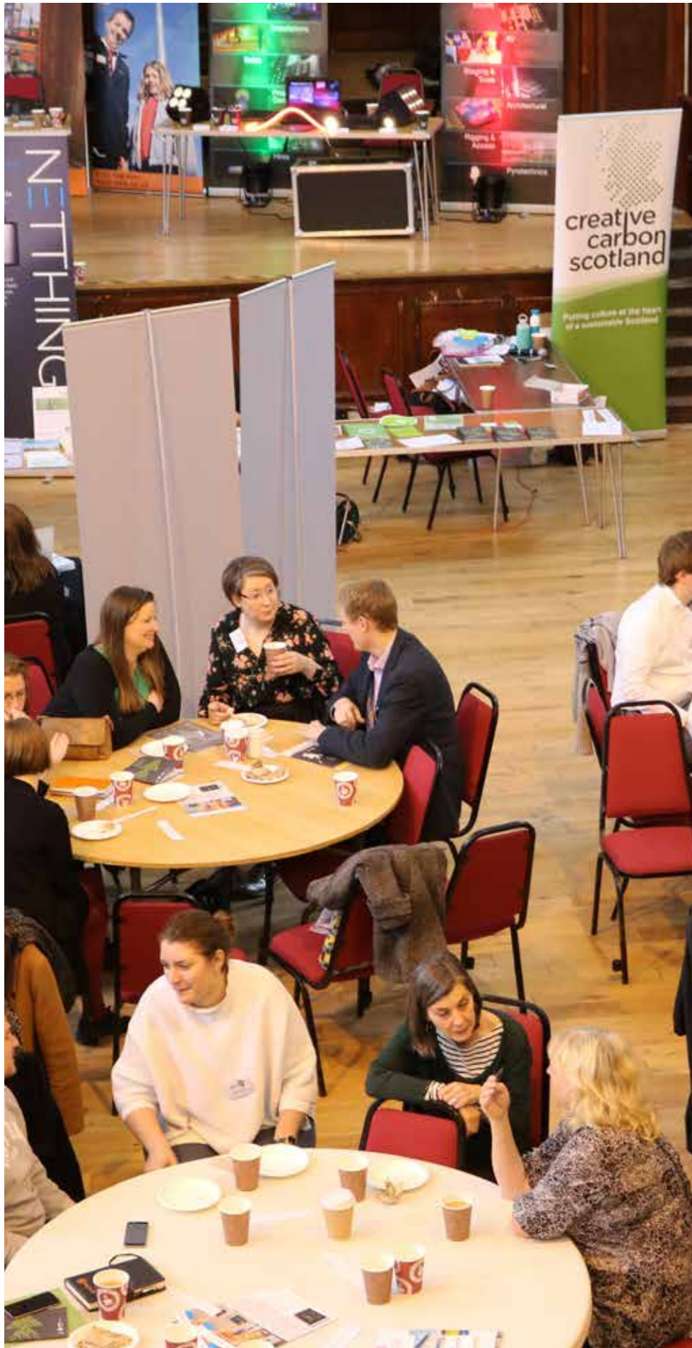
Green Arts Initiative, 51 Shades of Green Action in the Arts.

include engagement with the sustainability targets of their city or local authority. For example, participation in the GAI is one of the actions in Edinburgh's Climate Change Adaptation Action Plan for 2016-2020.