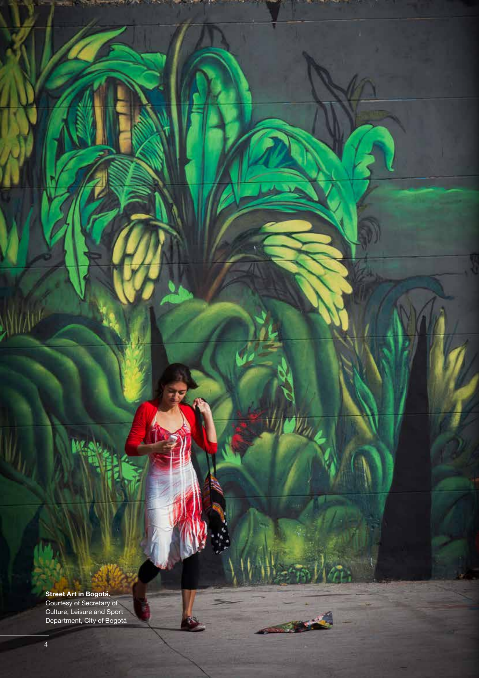
Street Art in Bogotá.