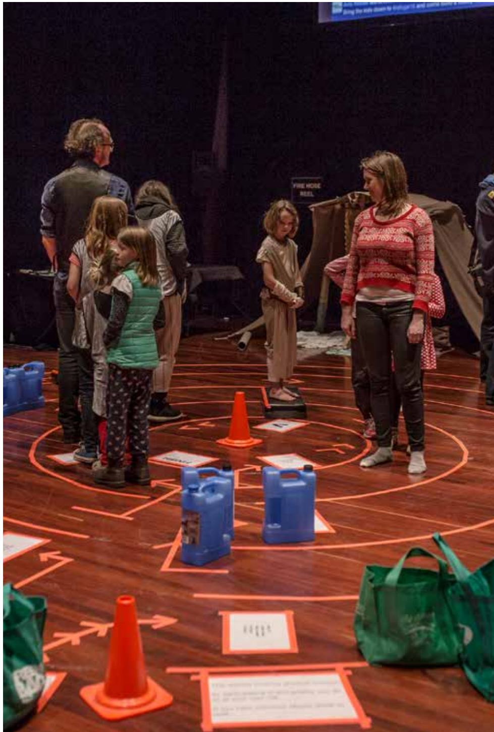
Refuge Project, Melbourne.