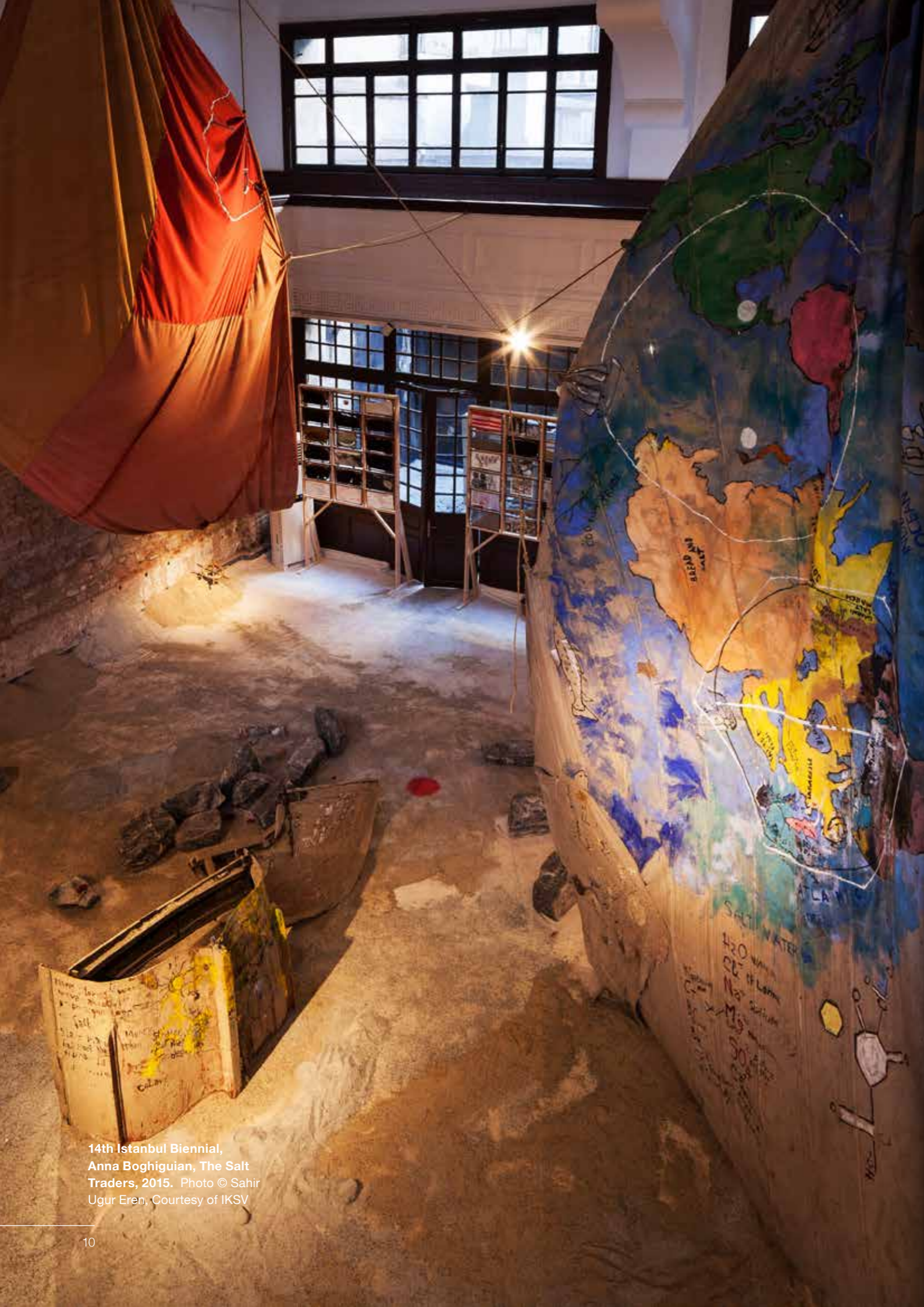
14th Istanbul Biennial, Anna Boghigian, The Salt Traders , 2015. Photo © Sahir Ugur Eren, Courtesy of IKS