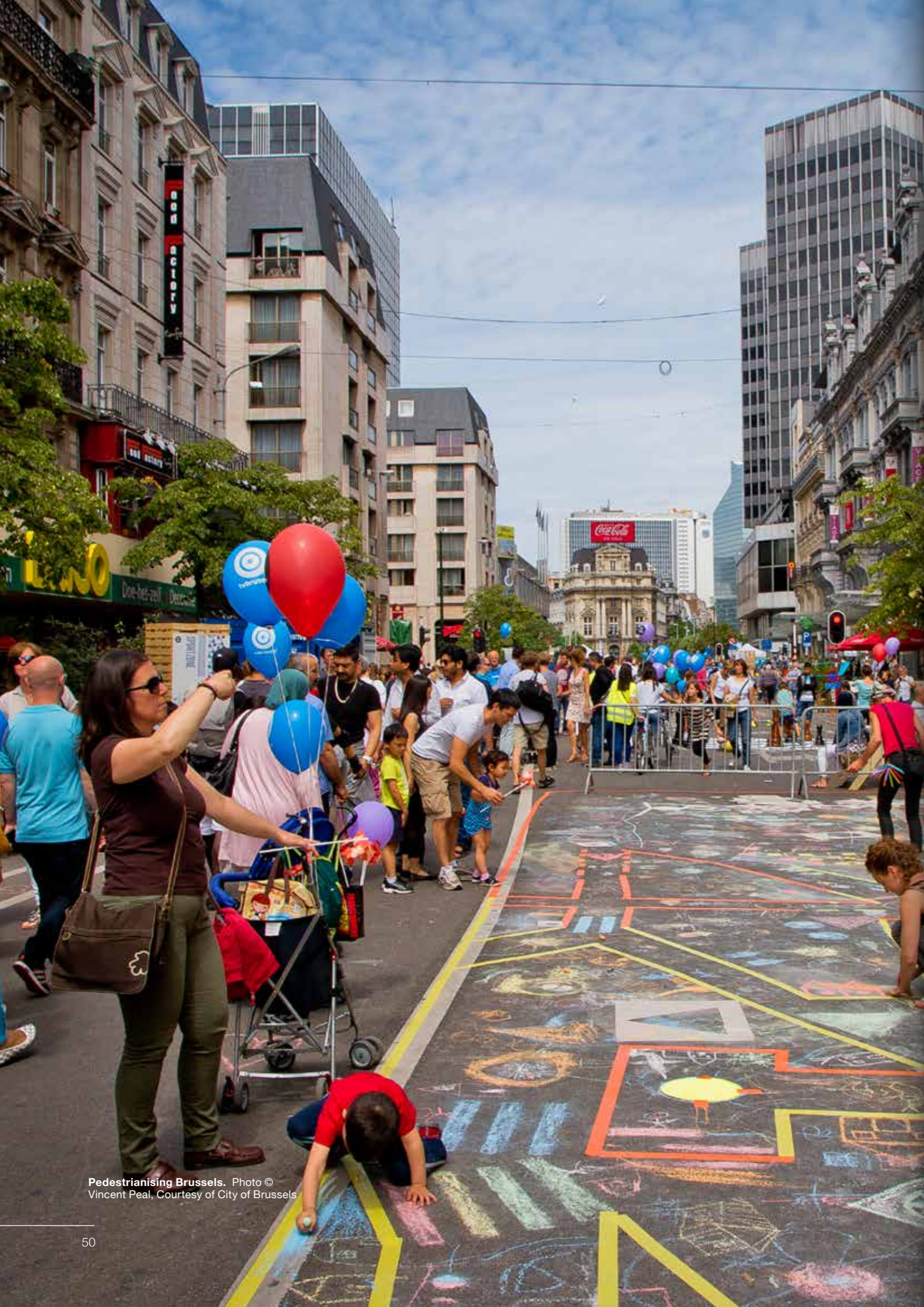
Pedestrianising Brussels.