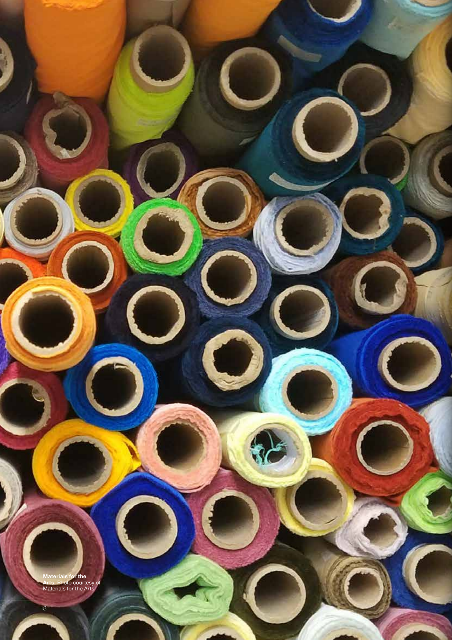
Materials for the Arts.