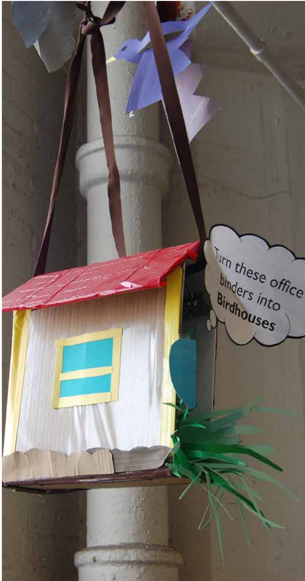
Materials for the Arts.

corporations for volunteering as part of corporate 'Give Back' days and Corporate Social Responsibility programmes.