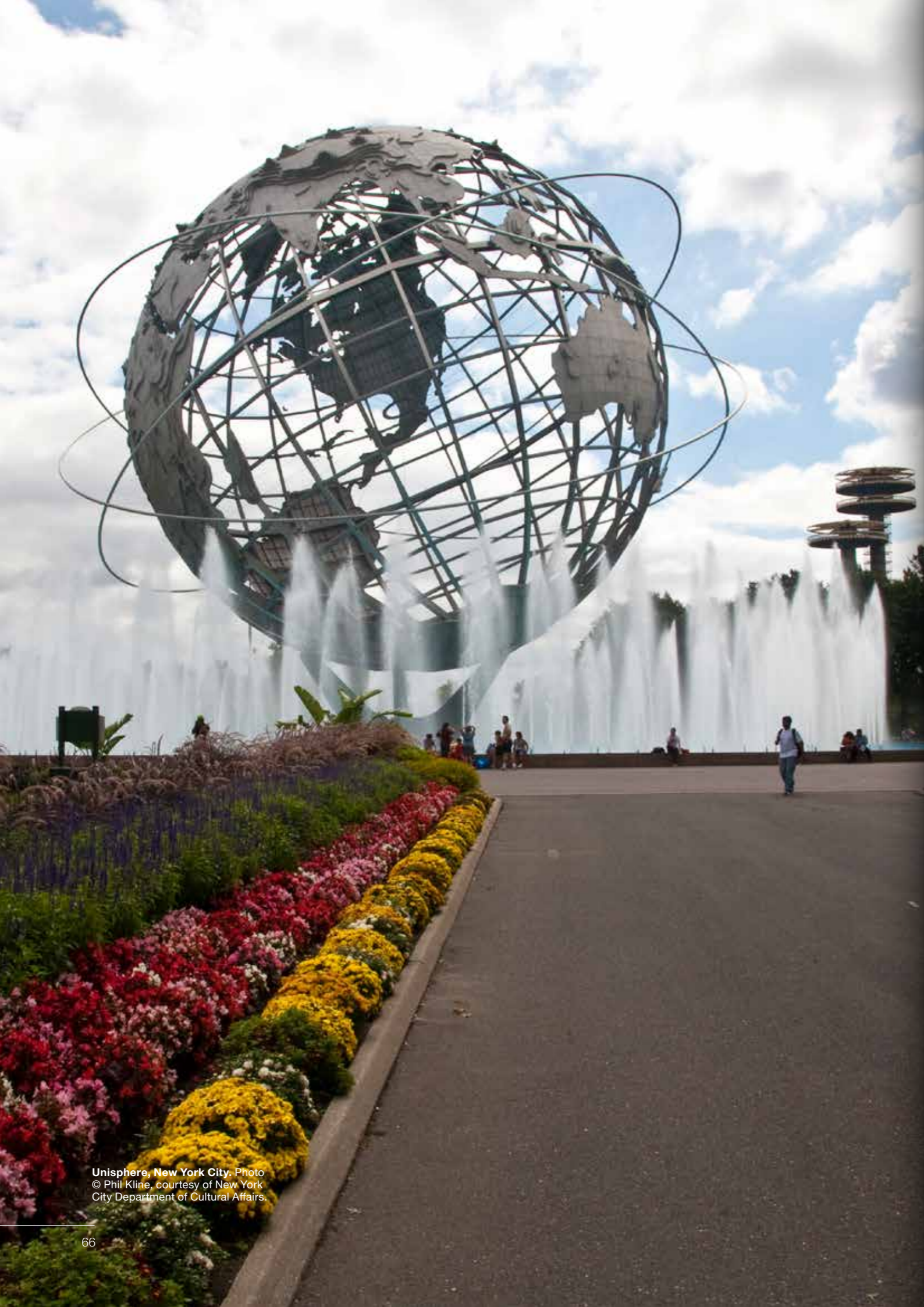
Unisphere, New York City.