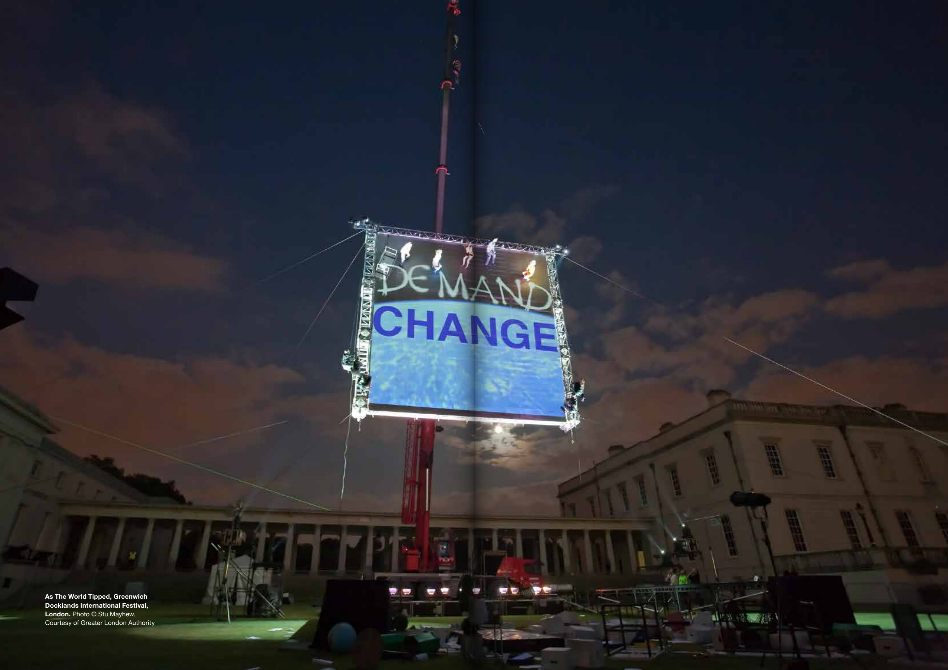
As The World Tipped, Greenwich Docklands International Festival, London.