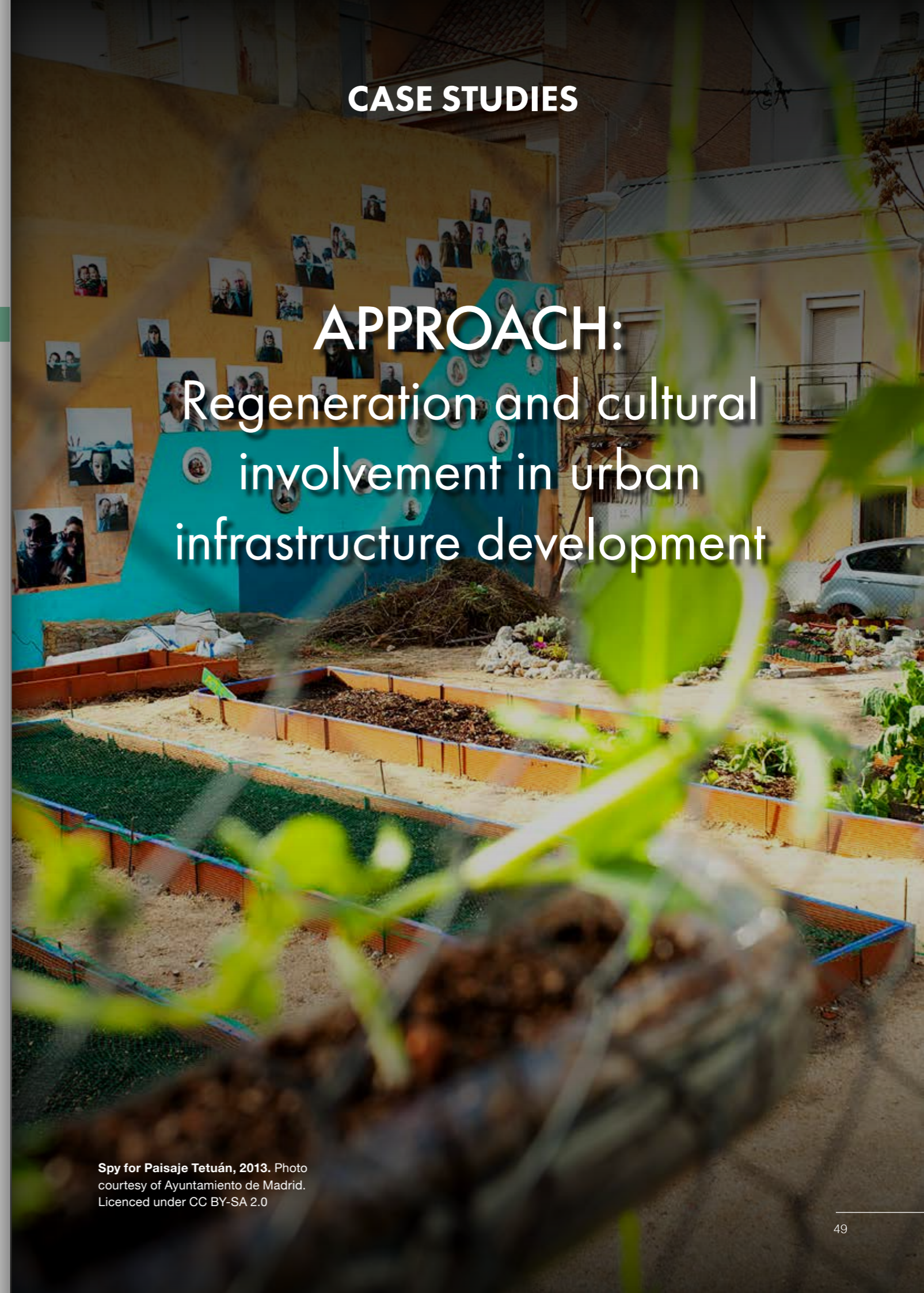
Spy for Paisaje Tetuán, 2013. Photo courtesy of Ayuntamiento de Madrid. Licenced under CC BY-SA 2.0

APPROACH: Regeneration and cultural involvement in urban infrastructure development