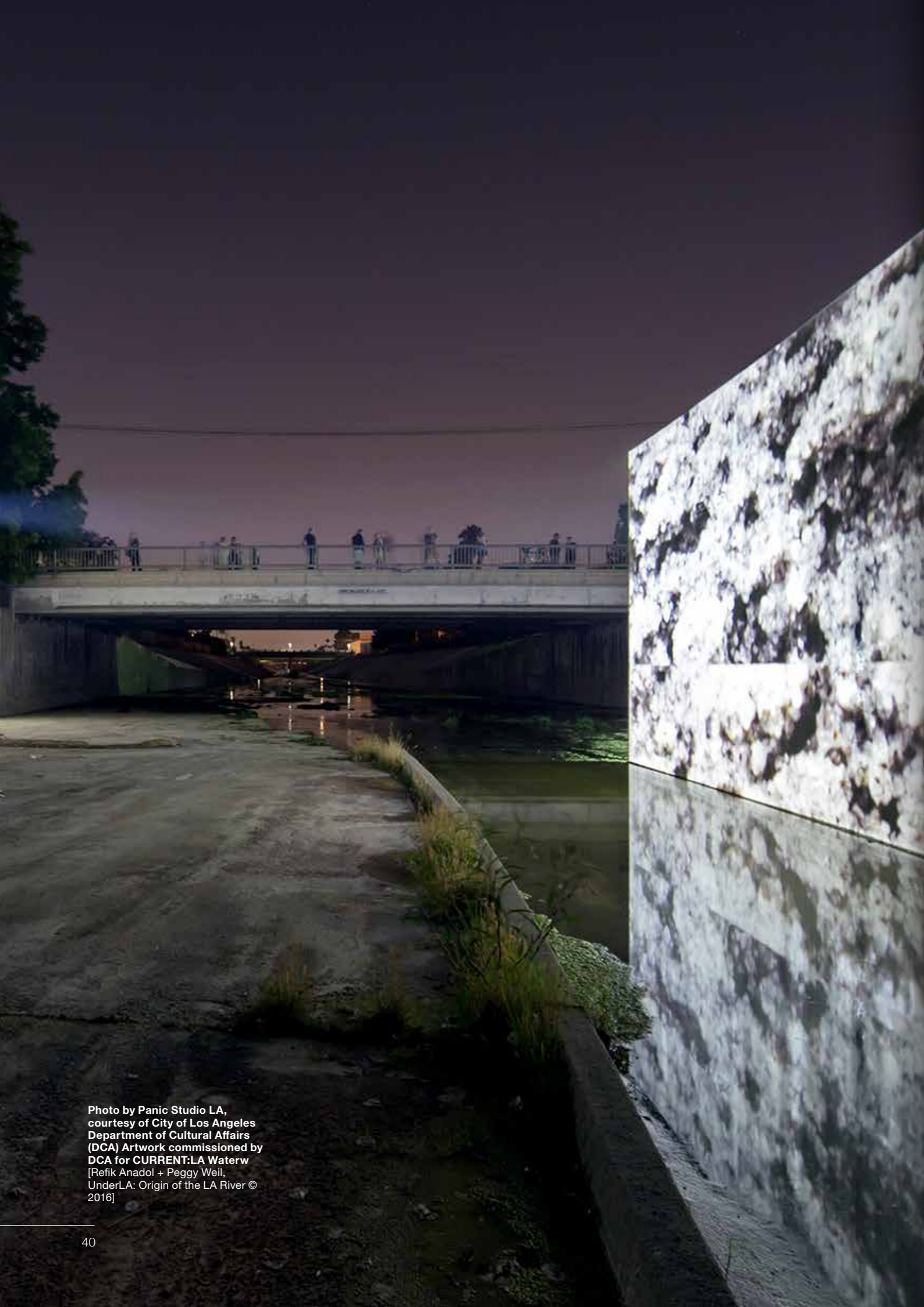
Artwork commissioned by DCA for CURRENT:LA Waterw [Refik Anadol + Peggy Weil, UnderLA: Origin of the LA River © 2016]