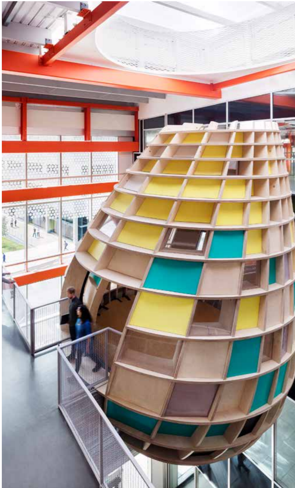
Here East.

Gaining meaningful data from organisations also proved to be challenging. In order to align the Green Guides to the targets and ambitions of the London Climate Change Action Plan, they needed sector datasets that were clean and robust. This was achieved through a resourced member of Julie's Bicycle staff, who visited organisations, collated and reviewed the available data.