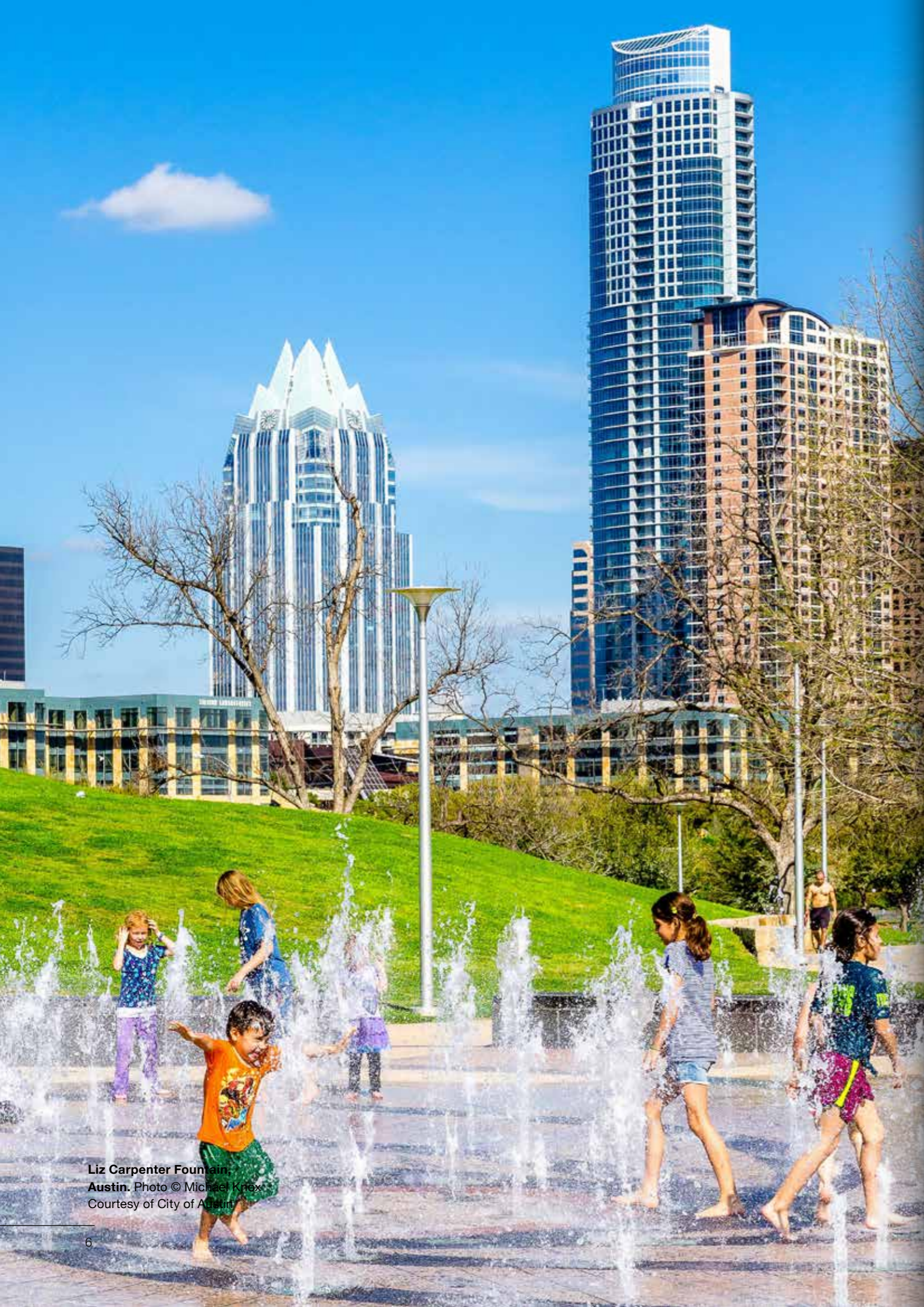
Liz Carpenter Fountain, Austin.