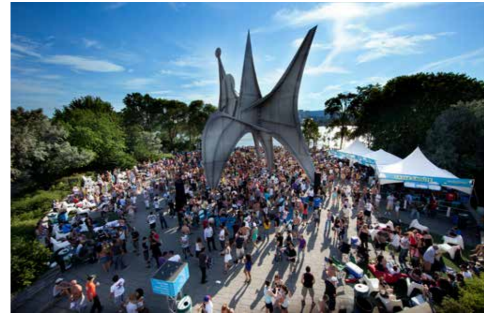
6/ A United Nations framework that aims to 'end all forms of poverty, fight inequalities and tackle climate change.' http://www.un.org/ sustainabledevelopment/