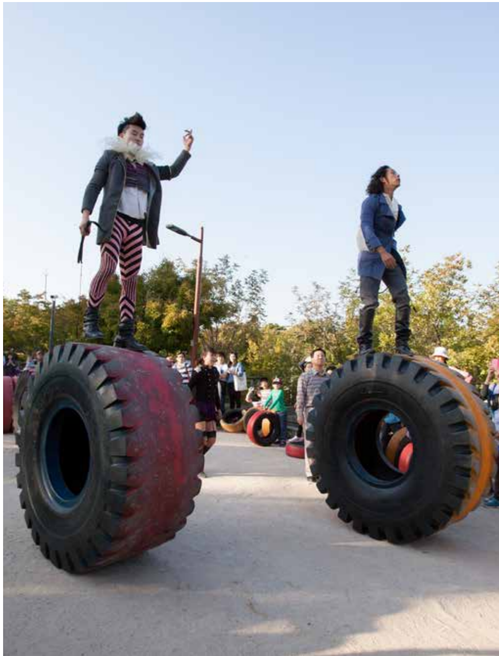
Seoul Street Performance.