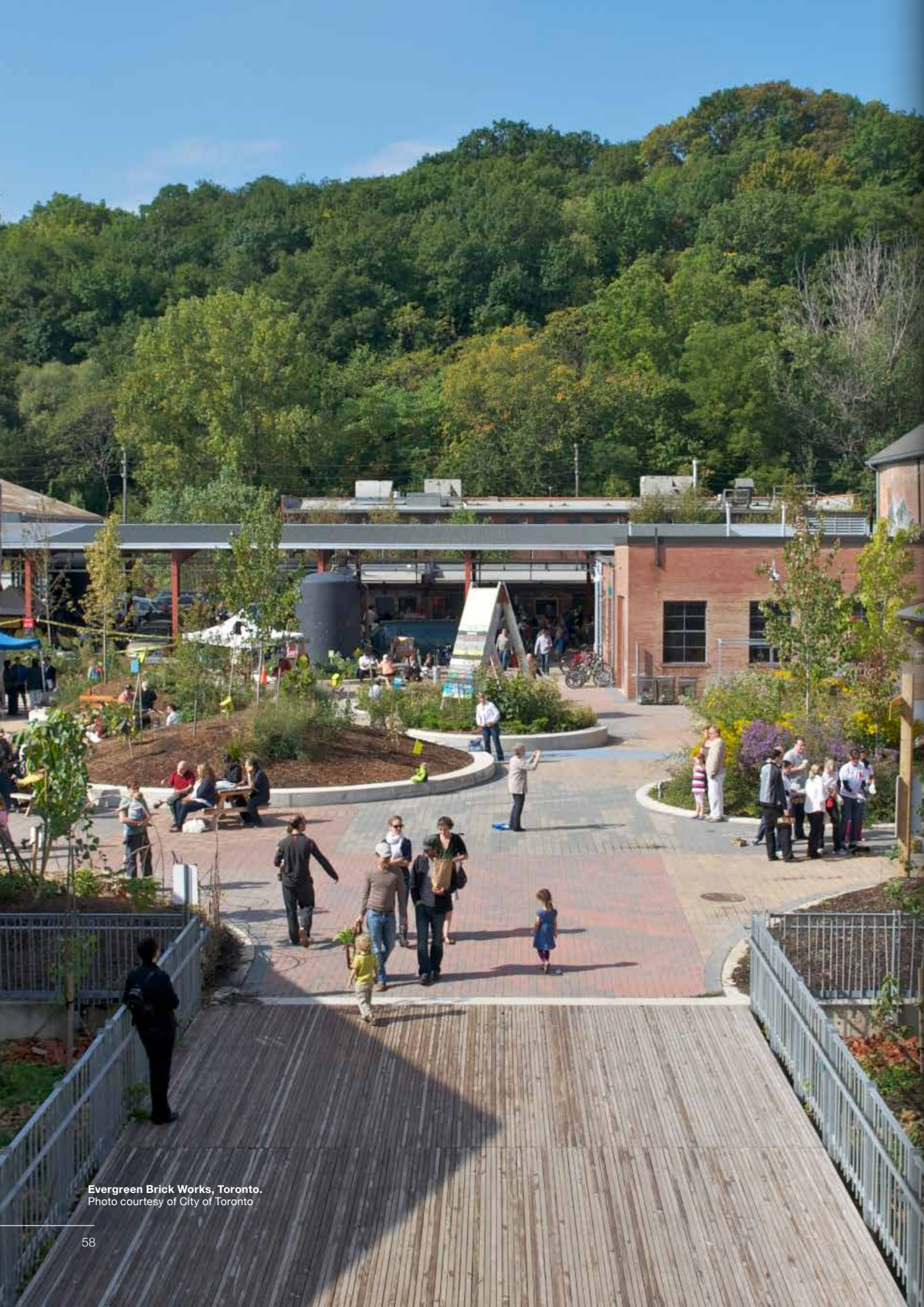
Evergreen Brick Works, Toronto.