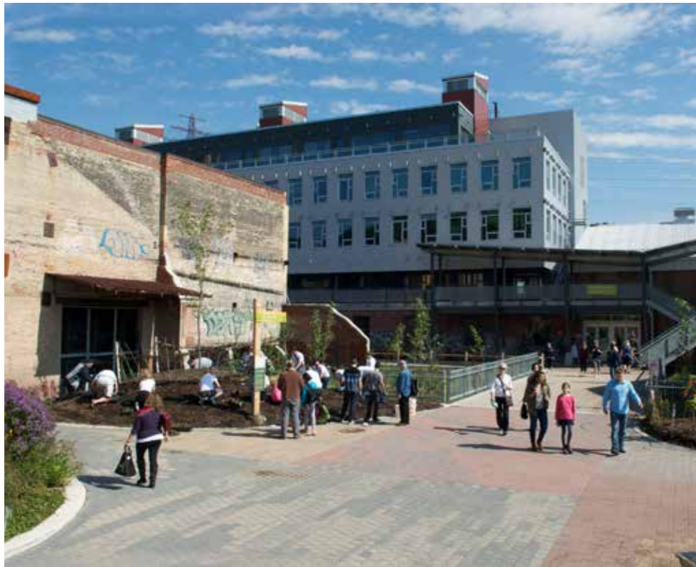
Evergreen Brick Works, Toronto.