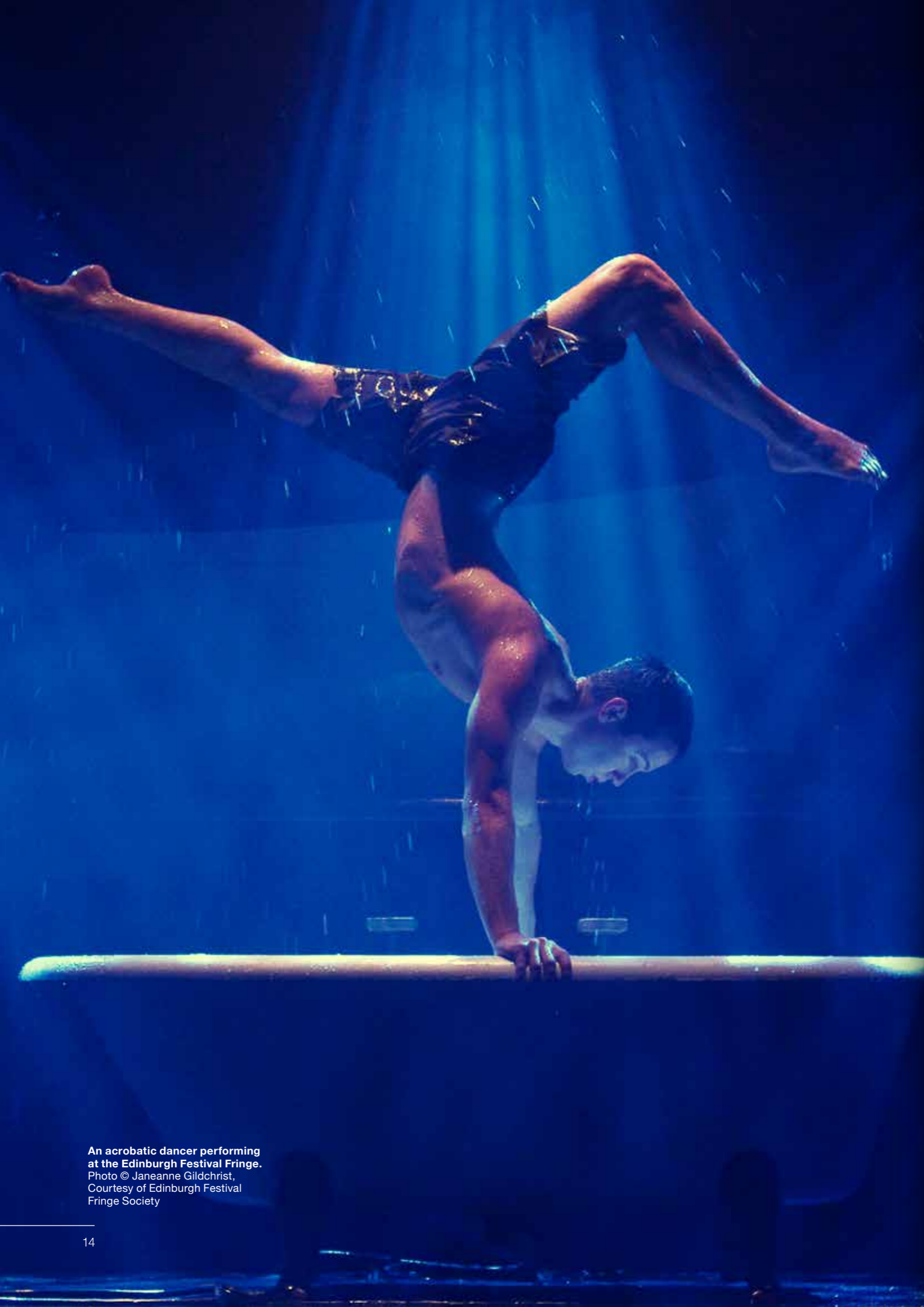
An acrobatic dancer performing at the Edinburgh Festival Fringe.