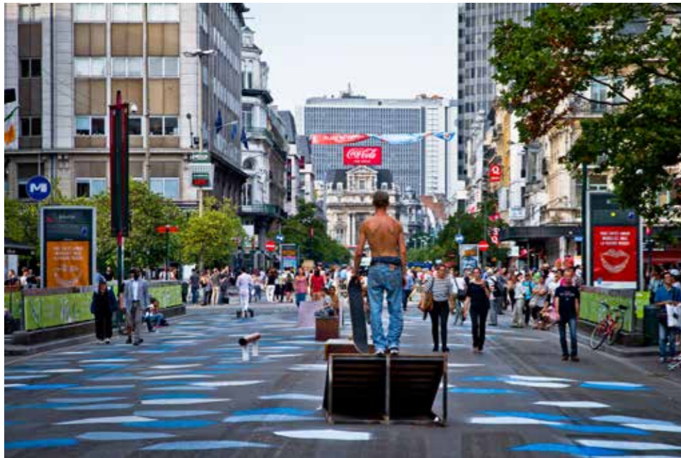
Pedestrianising Brussels.