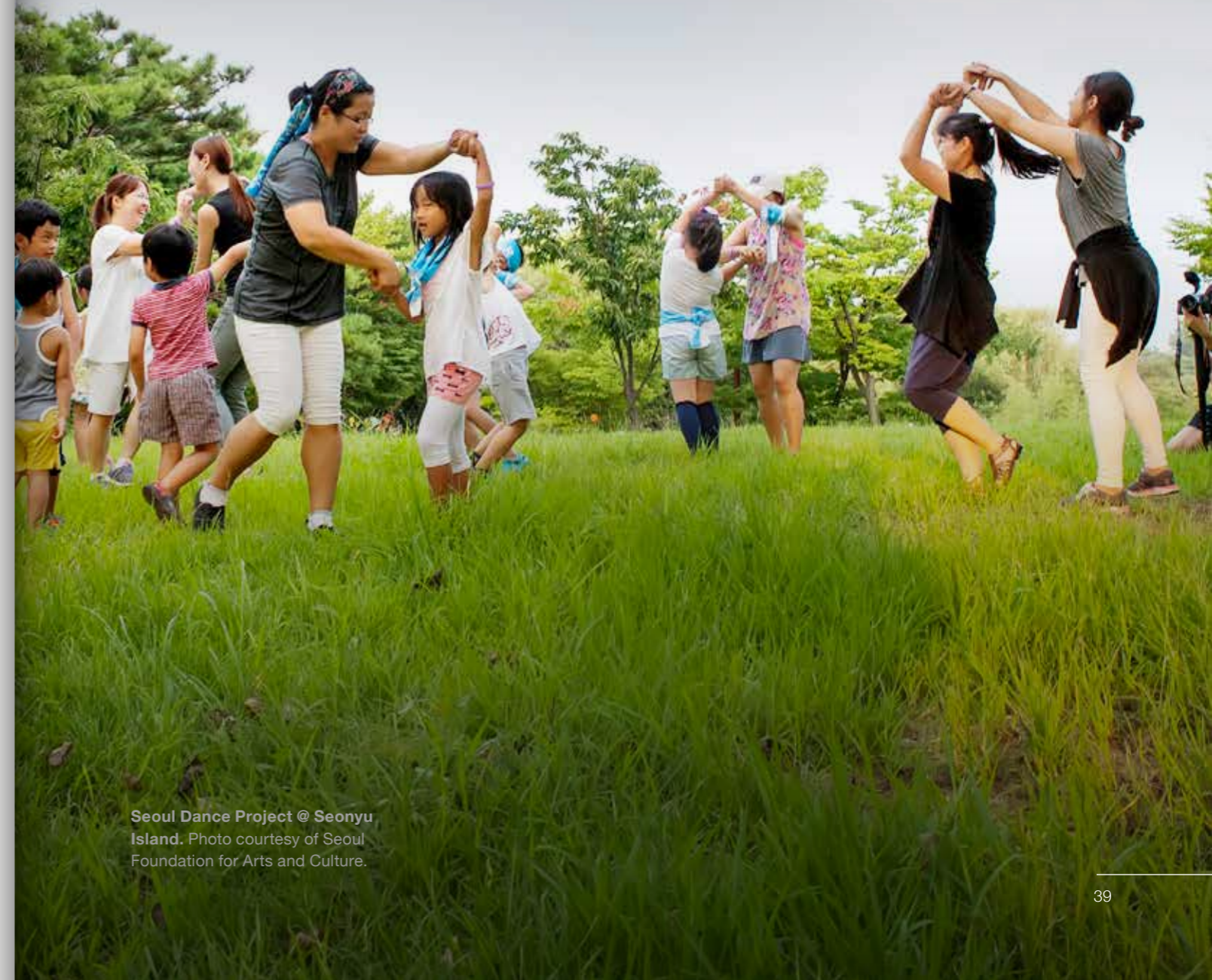
Seoul Dance Project @ Seonyu Island.