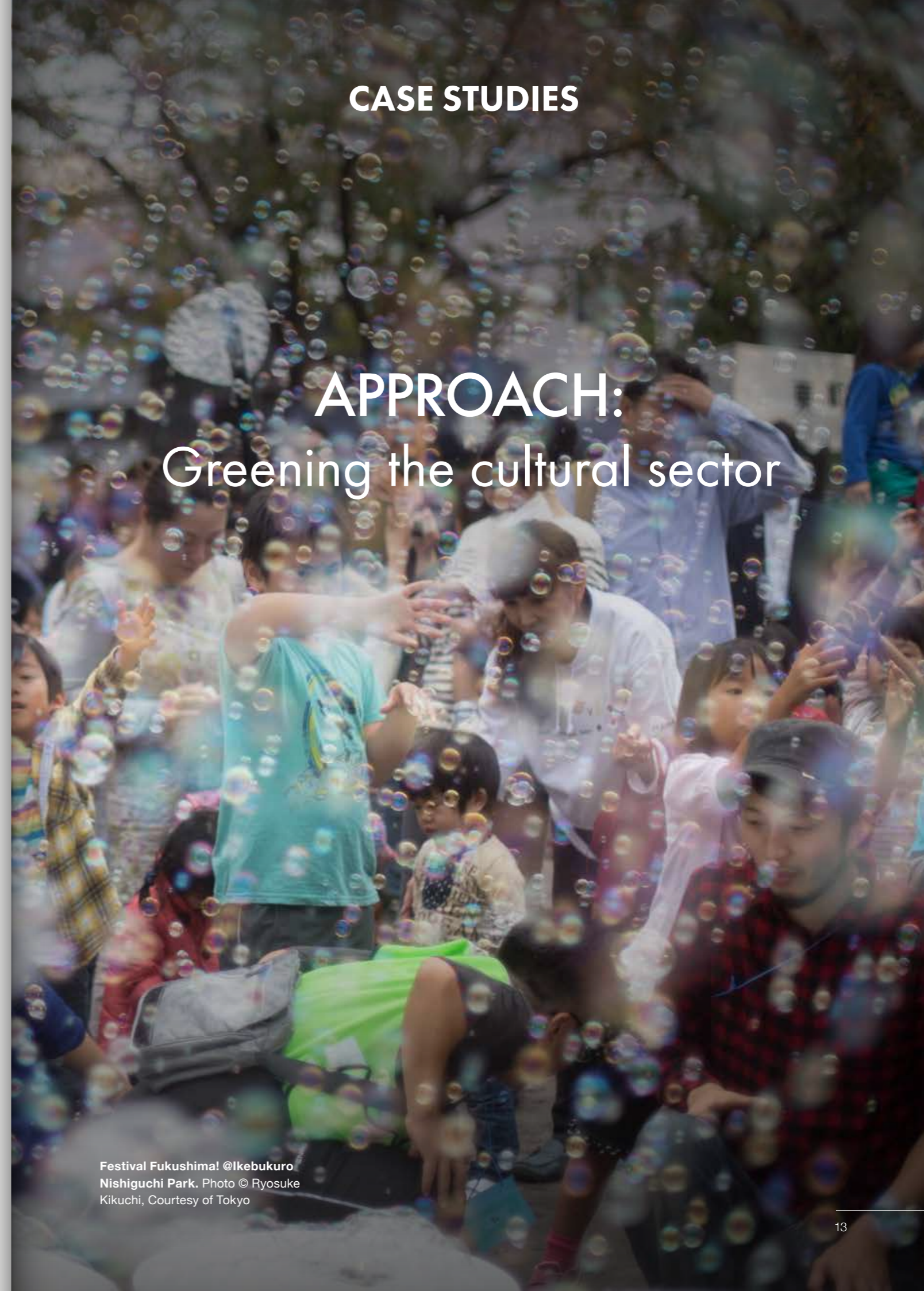
Festival Fukushima! @Ikebukuro Nishiguchi Park.